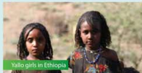
Yallo girls in Ethiopia

New programs have commenced, around HIV prevention in Mozambique, Solar Lights in Solomon Islands and Tanzania, Maternal and Child Health in Ethiopia and Kenya, breast cancer treatment in Palestine.